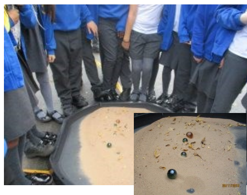
Weston Favell children enjoying science outdoors