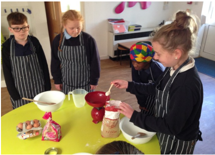
Cooking classes - enjoyed by all years at Thorplands