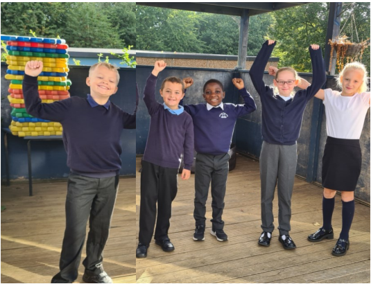
Part of the winning team at a recent rugby tournament