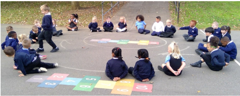
Year 1 children enjoying a Maths lesson outdoors

Thorplands is a one form entry safe, happy and caring primary school where everyone is accepted and treated with respect. The staff are passionate that every learner at Thorplands will be the best they can be and all adults have nothing but the highest of expectations. An enriched curriculum is on offer, to help the children to develop a thirst for learning that will last forever.