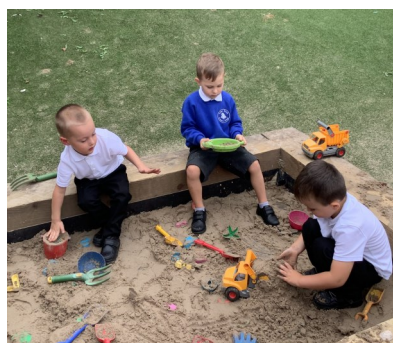
Reception 2021 children settling in at Ecton Brook

Previous editions of the NPAT News are available on your child's school website and will give you an insight into some of the marvellous opportunities your child will experience in