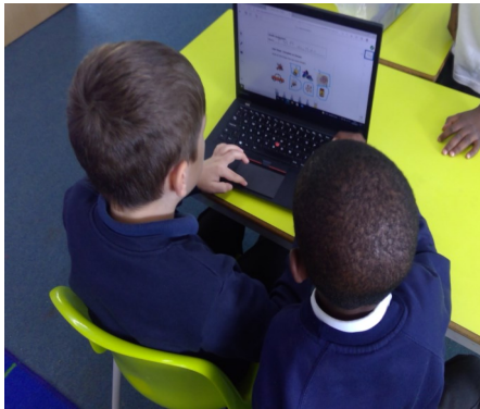
Yr 2 children in their first computing class