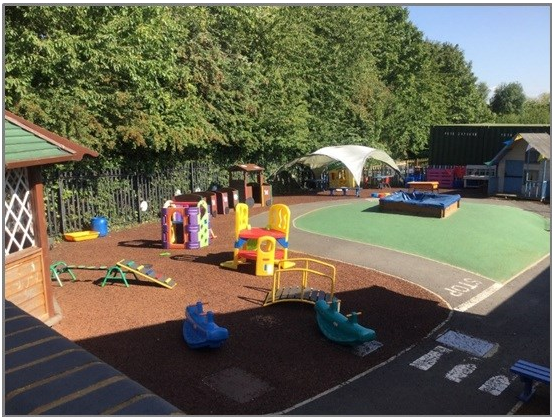
Thorplands Nursery Playground

Please call in at any time to have a look at the nursery, or telephone 01604 493384 for more information.