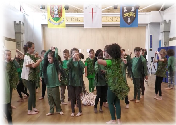
Simon de Senlis

We are drawing to the end of another disrupted year, with news filtering through of how schools might operate under new guidance regarding from Covid. Staff will be working hard to ensure that school life continues safely and positively in the new academic year.