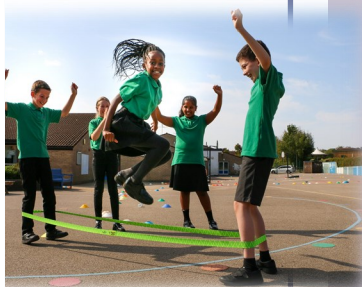
Children @ Sds Learning to skip

benefits of outdoor sport and play have long been recognised: Improves vision, promotes social skills, increases attention span, reduces stress, increases vitamin D levels. With careful management as per the guidelines e.g children kept in consistent groups, equipment thoroughly cleaned between each use by different individual groups, our teachers are making sure that these benefits continue to outweigh any risk. For lots of fun ideas to support keeping your child active outdoors at home Click here